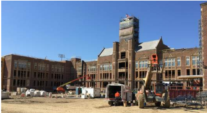
Courtyard Window Installation