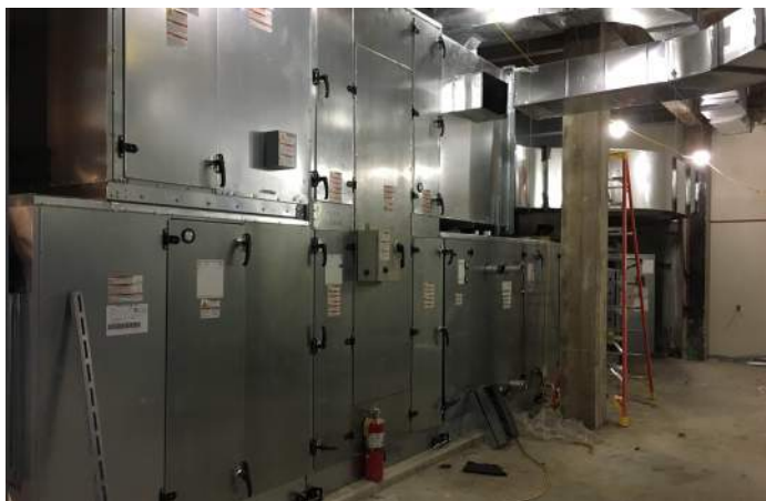
Area F 3rd Floor AHU Assembly