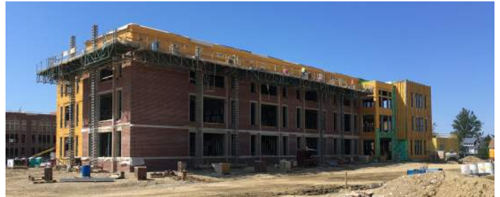
Area F East Elevation Brick Veneer Installation