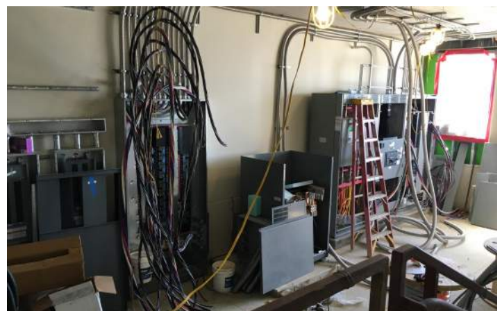
Area A Washington Level Electrical Room