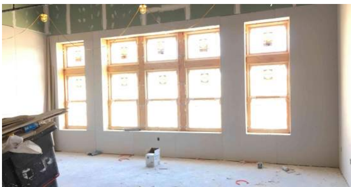
Area A 3rd Floor Drywall Installation